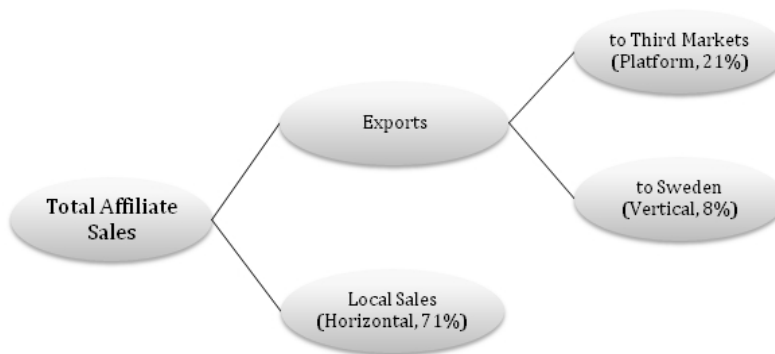
Figure 2: SALE COMPOSITION OF SWEDISH MNEs: ALL NEWLY ESTABLISHED AFFILIATES, 1987-1998

back to the parent country or elsewhere. These can be called vertical and export platform FDI, respectively. In this paper, I take this difference into account.